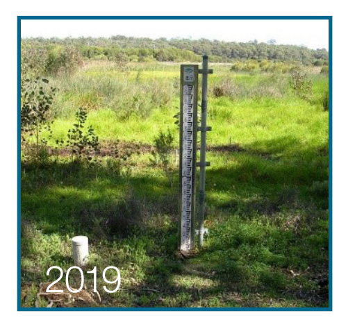
Loch McNess, near Yanchep WA, now contains much less water

Climate change combined with groundwater abstraction is having a measurable and visible impact on the water balance of Perth's groundwater system and its associated environmental values, including wetlands, caves, lakes and bushland. This is significantly affecting the long-term sustainability of Perth's groundwater as a natural, good-quality source of water for Perth.