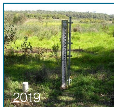
Loch McNess, near Yanchep WA, now contains much less water

Climate change combined with groundwater abstraction is having a measurable and visible impact on the water balance of Perth's groundwater system and its associated environmental values, including wetlands, caves, lakes and bushland. This is significantly affecting the long-term sustainability of Perth's groundwater as a natural, good-quality source of water for Perth.